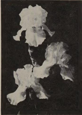
NEW SNOW A ruffled, pure white with a yellow beard